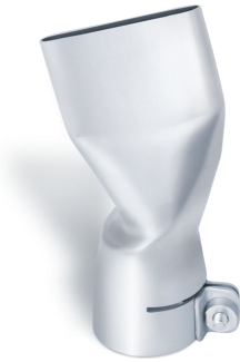
Flat angled nozzle 40*2 mm