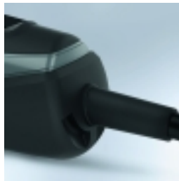
Replaceable power cord