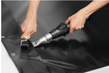
Smoothing Tarpaulins and Ground sheets