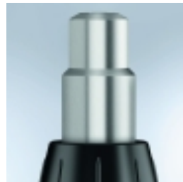
Suitable screw on nozzle