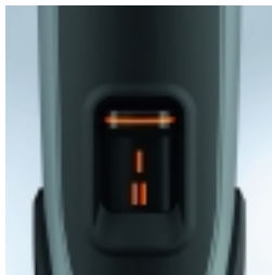
2 stage air flow