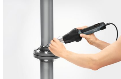
Welding in apparatus construction