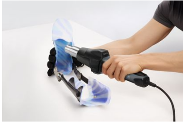
Fitting artificial limb