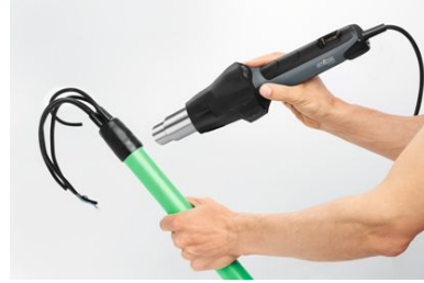
Industrial Heat shrinking