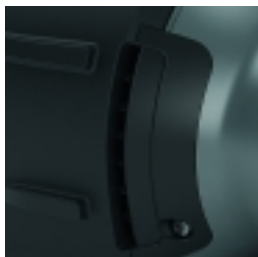
Fine dust filter